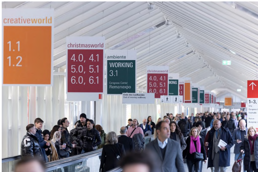
Visitors galore: the trade fair trio of Ambiente, Christmasworld and Creativeworld is the global meeting place for the consumer goods industry.

Frankfurt am Main, 9 February 2025: The trade fair trio of Ambiente, Christmasworld and Creativeworld is experiencing a real rush of visitors. On the third of five trade fair days, trade visitors from the German and international retail sector and from the contract business are once again streaming to the fully booked exhibition centre to be inspired by the new products from 4,660 exhibitors. One thing is already clear: this trade fair exceeds all expectations. Exhibitors are pleased with the high frequency, visitors with the intensive trade talks and comprehensive events, lectures and tours.