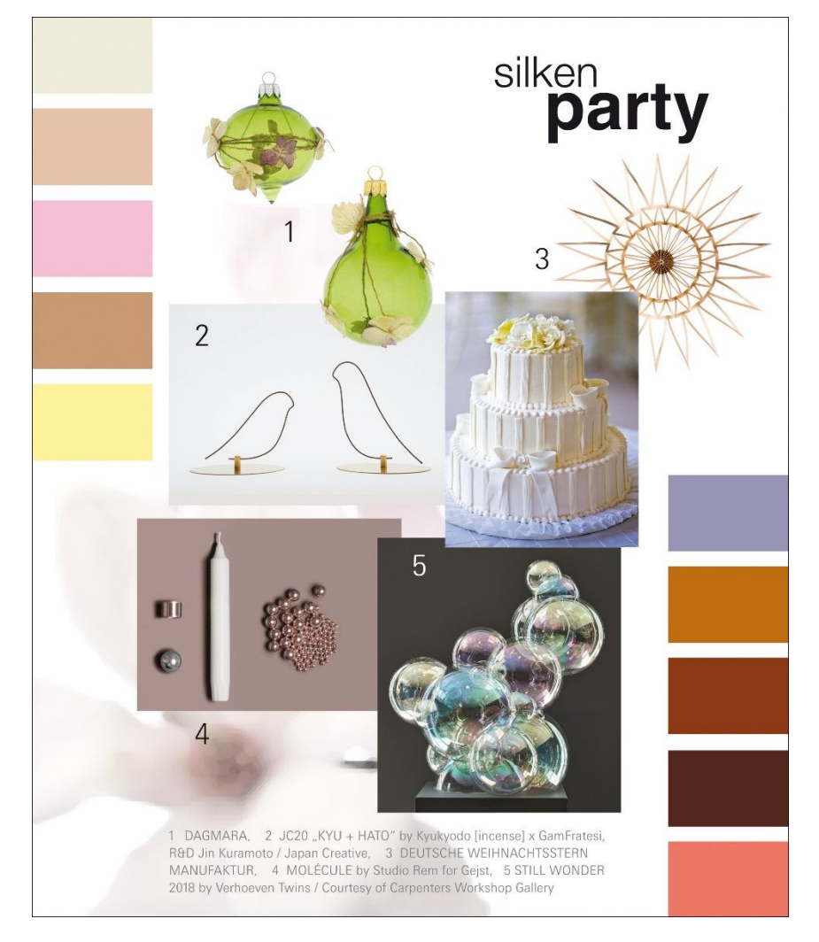
silken party encourages a feminine colour range, high-quality materials and shiny ultra-smooth surfaces – the festive experience comes across as pleasantly soft, warm and tactile.

The designs for this elegant and sensuous style world are characterised by soft, organic and cloudy shapes. Unusual blossoms and petals provide a strong source of inspiration. It is a decorative scheme that comes over very well at weddings and summer celebrations.