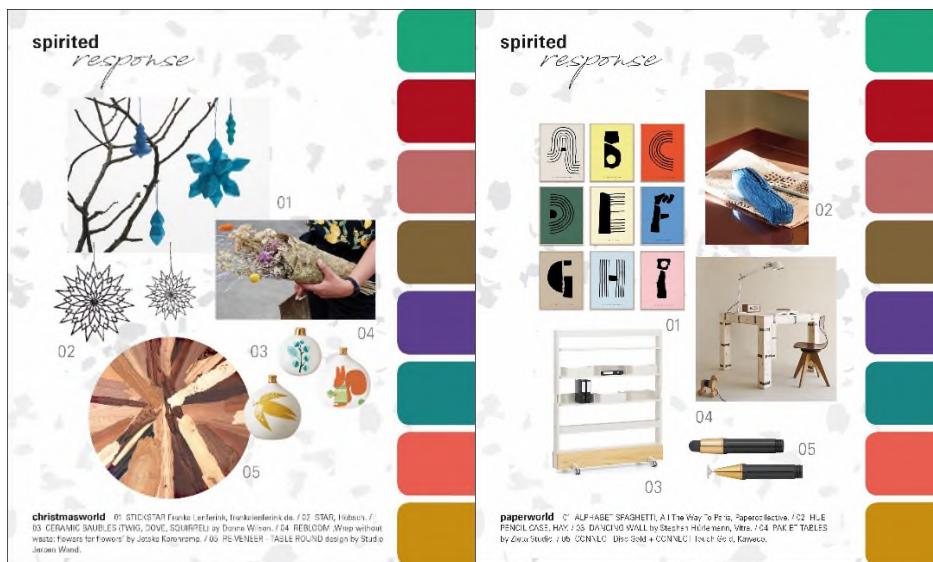
"spirited response" inspires with sustainable solutions: original, creative and unconventional.

Not a trend, but a necessity. This style world presents attractive alternatives and unconventional solutions that focus on zero waste, a circular economy and up & recycling. Here the emphasis shifts to the arrangement of the home office for job and school. The design is handcrafted, creative, cheerful, colourful and uncomplicated. Organic forms and eye-catching, illustrative designs reminiscent of the 1960s have a strong impact. Hand written or drawn print motifs, childlike sketches and ideas with an improvisational character round off the original style.