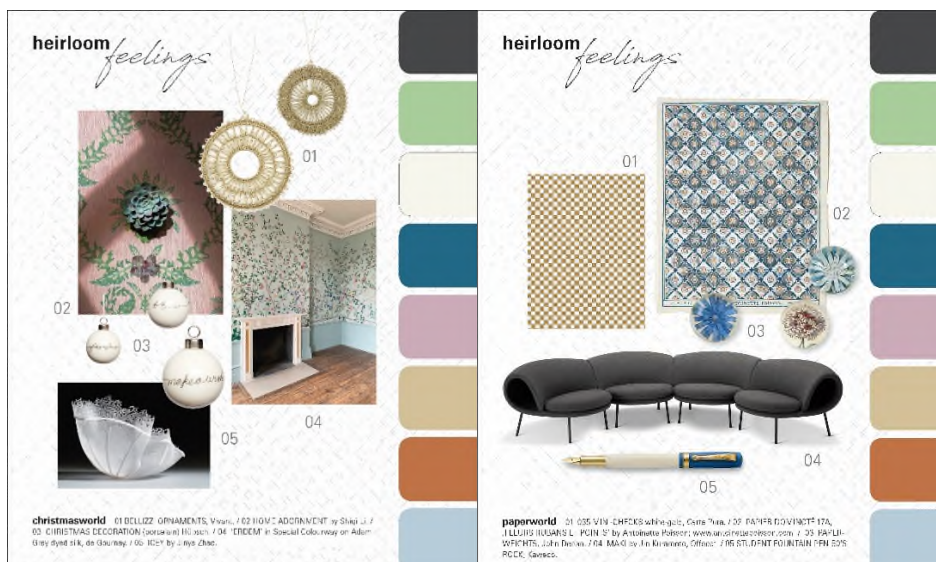
"heirloom feelings" reflects on poetry and gracefulness: nostalgic, young and playful feelings".

This poetic, young style opens up an optimistic perspective. Numerous artistic and playful aspects can be discovered in the design, including more down-to-earth interpretations in delicate hues. The cheerful, lively flora is striking. Blossoms, scattered flowers, mille fleur and vines sprout alongside frills, fine graphic designs, necktie and chequered patterns. The numerous romantic tapestries are in the foreground here as quotations from a golden era. The joy of adorning is reflected in every aspect of the product and of life: from festive decorations, gift wrapping papers and greeting cards to stylish working and writing.