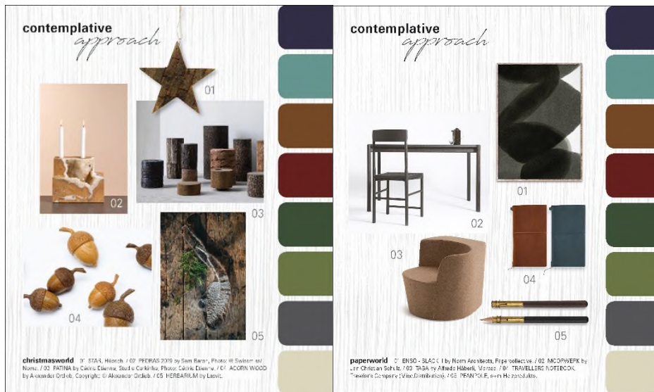
"contemplative approach" focuses on nature: original, tactile and unpretentious.