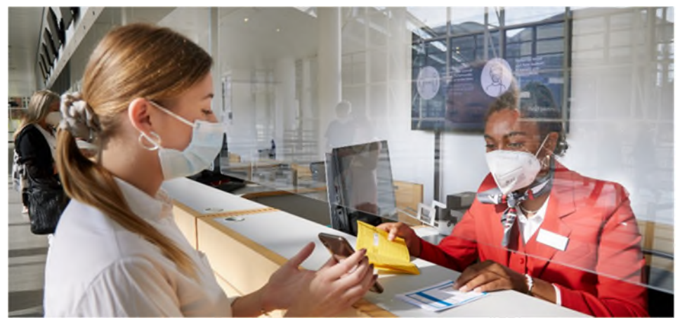
Proof of vaccination, recovery or negative test.

A recent survey of 59,000 companies conducted by Messe Frankfurt highlights just how badly in-person encounters at trade fairs have been missed. The result: 97 percent of companies surveyed want to resume exhibiting on site at trade fairs. In fact, two-thirds of respondents would like trade fairs to take place entirely in person.