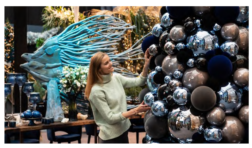
Christmasworld brings the wow experience that festive and seasonal decorations create to new halls and invites the international consumer goods sector to network, inspire and order from 3 to 7 February 2023.

Frankfurt am Main, August 2022. The number of registrations for Christmasworld 2023 is at a top level and hall planning is well advanced. All the major national and international key players are already on board.