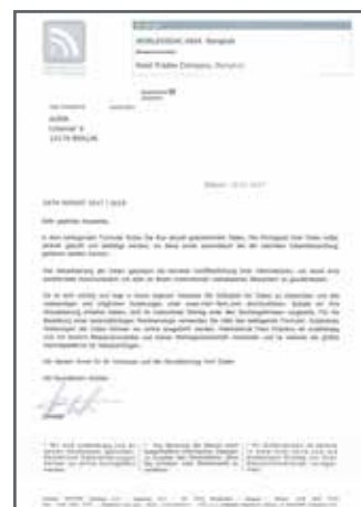
Example of an unofficial exhibitor directory of the International Fairs Directory

The official Messe Frankfurt publications