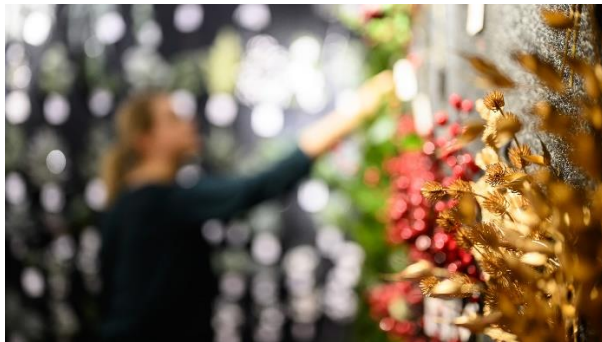
Christmasworld provides plenty of inspiration for a wide variety of goods and a successful business season.

Frankfurt am Main, October 2023. Christmasworld rings in a new round with its globally unique product mix of seasonal decorations and festive decorations. All key players are on board. With optimised routes and better connections to global sourcing, buyers will be able to find the latest highlights even faster – whether for festive decorations at home, for shopping centers or for city centers. The question is: Which exhibitors will be there?