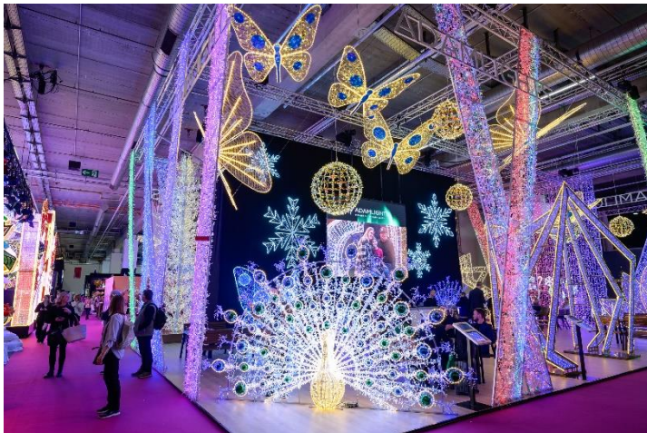
The product group Visual Merchandising & Lighting in Hall 4.0 is a guaranteed WOW experience and inspiration for spectacular concept decorations.